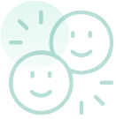
Personal, social and emotional development