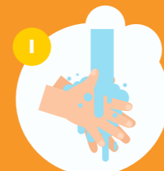
1 取水将手淋湿 Wet your hands with clean water