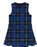
A-line winter pinafore dress