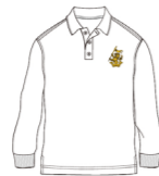
Long sleeve polo shirt