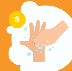
8 指尖在掌心揉搓 Rotational rubbing, backwards and forwards with clasped fingers of right hand in left palm and vice versa