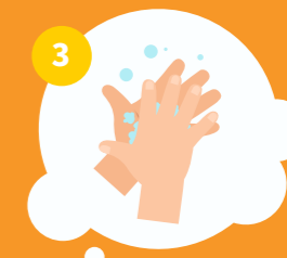
3 掌心对掌心相互揉搓 Rub hands palm to palm