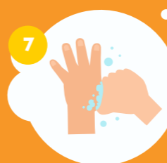
7 大拇指握在掌心转动揉搓 Rotational rubbing of left thumb clasped in right palm and vice versa