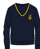
V-neck wool jumper