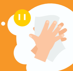
11 用纸巾擦干 Dry hands thoroughly with a single use towel