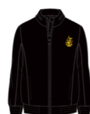
Light weight jacket