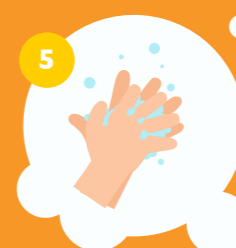
5 掌心对掌心十指交叉揉搓 Palm to palm with fingers interlocked