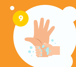
9 清洁手腕 Rotational rubbing of left wrist with right hand and vice versa