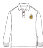
Long sleeve polo shirt