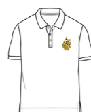
Short sleeve polo shirt