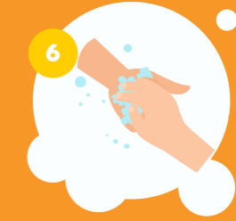
6 十指弯曲紧扣转动揉搓 Backs of finger to opposing palms with fingers interlocked