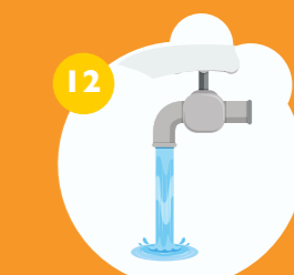
12 使用纸巾垫着关掉水龙头 Use a paper towel to turn off the tap