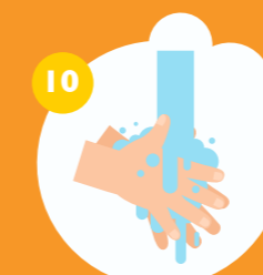
10 用水清洗双手 Rinse hands well with clean, running water