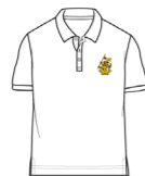
Short sleeve polo shirt