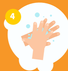
4 掌心对手背两手交叉揉搓 Right palm over left dorsum with interlocked fingers and vice versa