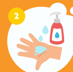
2 取足够皂液涂满整个手部 Apply enough soap to cover all hand surfaces