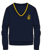
V-neck wool jumper